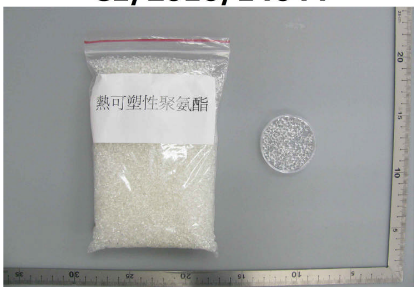
** 報告結尾 (End of Report) **

This document is issued by the Company subject to its General Conditions of Service printed overleaf, available on request or accessible at <a href="http://www.sgs.com/en/Terms-and-Conditions.aspx">http://www.sgs.com/en/Terms-and-Conditions.aspx</a> and, for electronic format documents, subject to Terms and Conditions for Electronic Documents at <a href="http://www.sgs.com/en/Terms-and-Conditions/Terms-e-Document.aspx">http://www.sgs.com/en/Terms-and-Conditions/Terms-e-Document.aspx</a>. Attention of advant to the limitation of liability, indemnification and jurisdiction issues defined therein. Any holder of this document is advised that information contained hereon reflects the Company's findings at the time of its intervention only and within the limits of client's instruction, if any. The Company's sole responsibility is to its Client and this document document only and within the limits of client's instruction, if any. The Company's sole responsibility is to its Client and this document document on the company and the report of the company. Any unauthorized alteration, forgery or falsification of the content or appearance of this document is unlawful and offenders may be prosecuted to the fullest extent of the law. Unless otherwise stated the results shown in this test report refer only to the sample(s) tested.